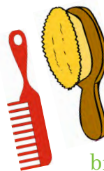
brush and comb